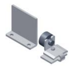
KT129 intrack door stop set