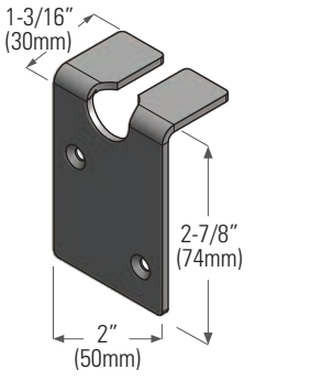
KT147 hanger adapter bracket, face mounted on door